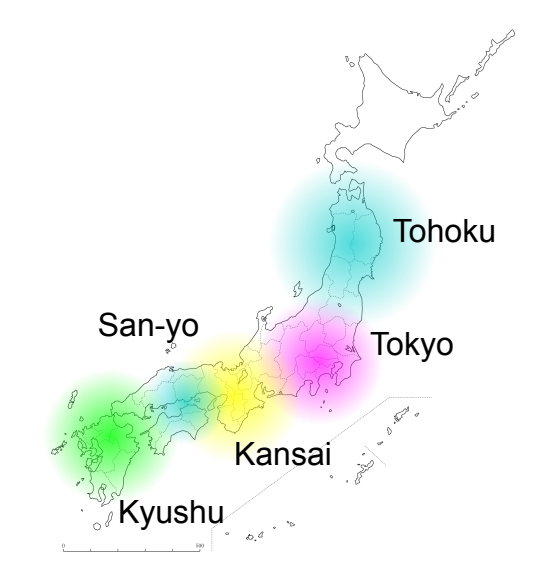
Figure 1: Locations of areas where dialects are spoken.

We selected one common language (Tokyo dialect) and four dialects (Kansai, Kyushu, Tohoku, and San-yo) to construct